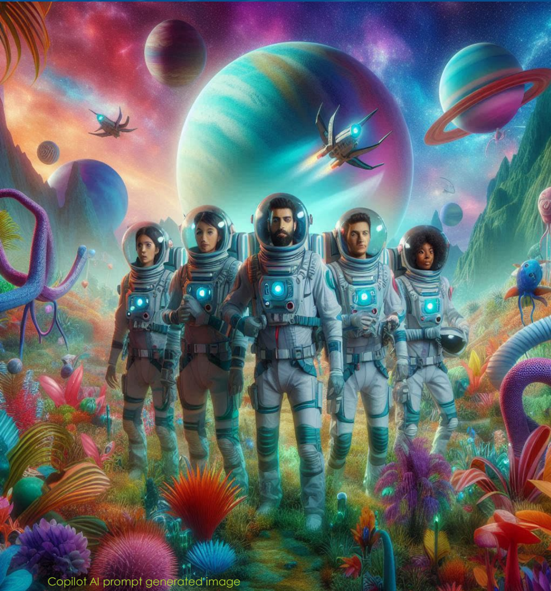
Capilot AI prompt generated image